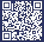
RUTX09 360° VIEW