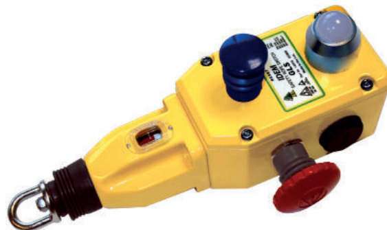
GLS-FZ: Special low temperature version -40C available.

Rugged internal sealing bellows means the GLS can be high pressure hosed and choice of materials makes them suitable for internal or external use.